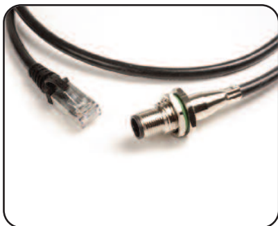
M12 cable assemblies can be configured with a variety of connector types including RJ45, straight and angled