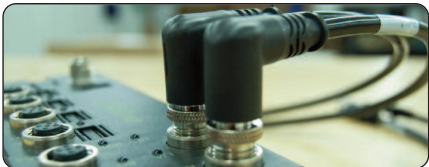
Resistant to dust, vibration and shock, the M12 D-Code is ideal for any industrial networking environment