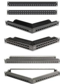
Kitted 5e Shielded Patch Panels with Outlets