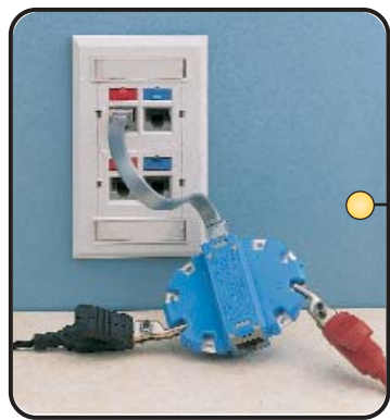
MODAPT.....Test adapter with one 152mm (6 in.) 4-pair universal plug-ended modular cord

One MODAPT allows access to 1-, 2-, 3-, and 4-pair keyed and non-keyed jacks and plugs