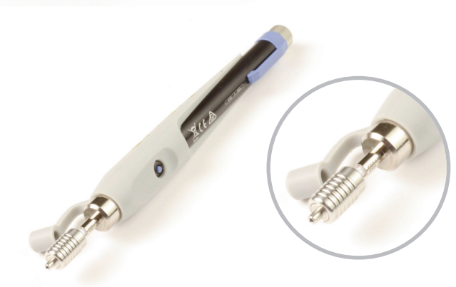
1.25mm Universal Connector Adapter – VFL with the optional 1.25mm universal connector adapter allows use with LC and MU connectors